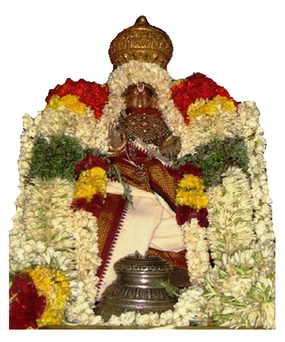
Swami Desikan - ThiruppullANi